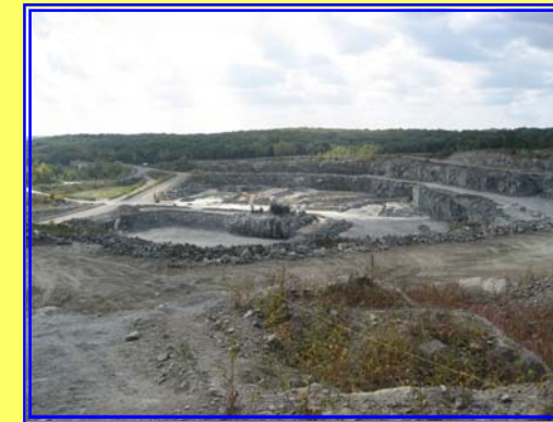
Left, Three, two, one....